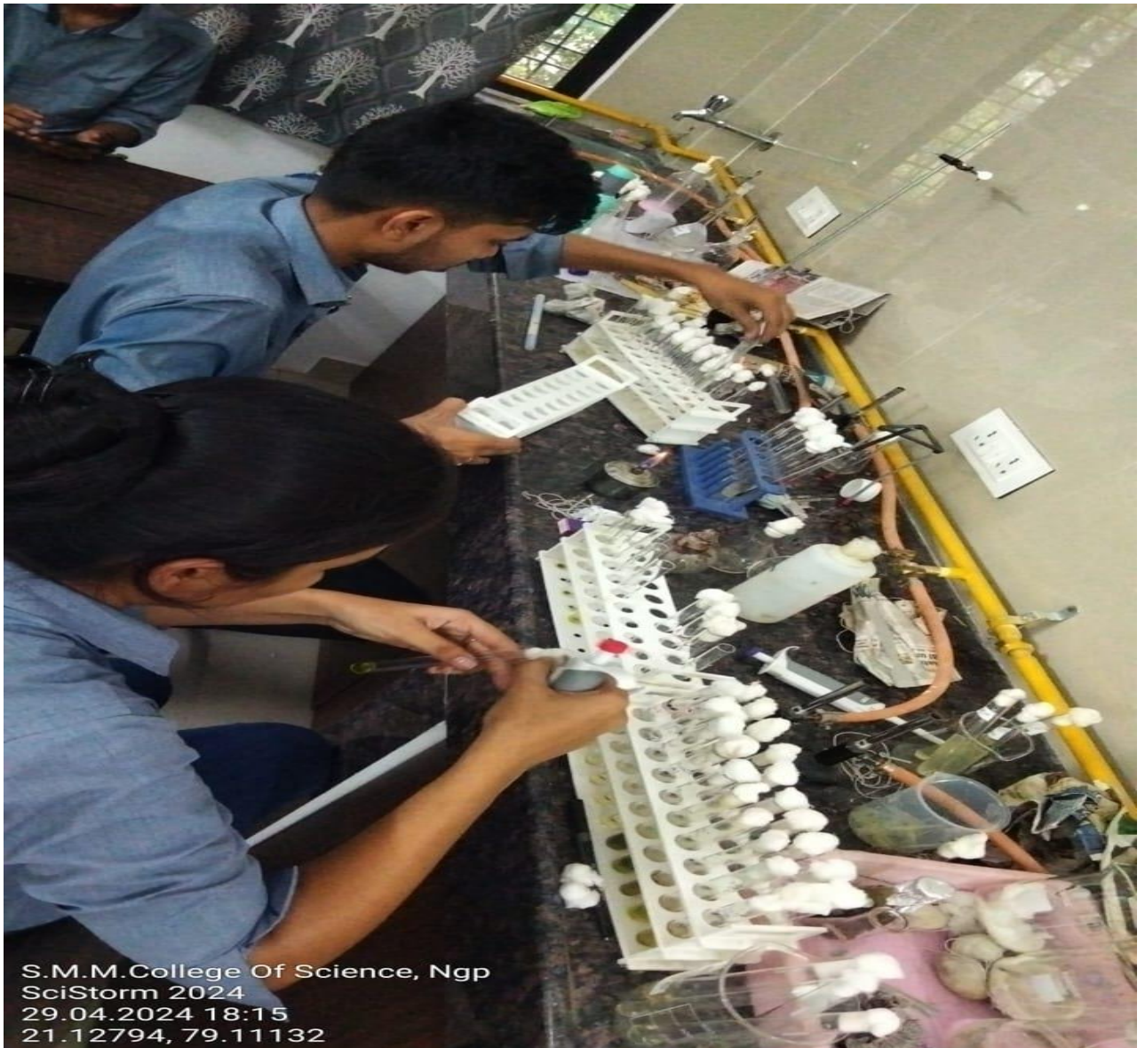
S.M.M.College Of Science, Ngp SciStorm 2024 29.04.2024 18:15 21.12794, 79.11132