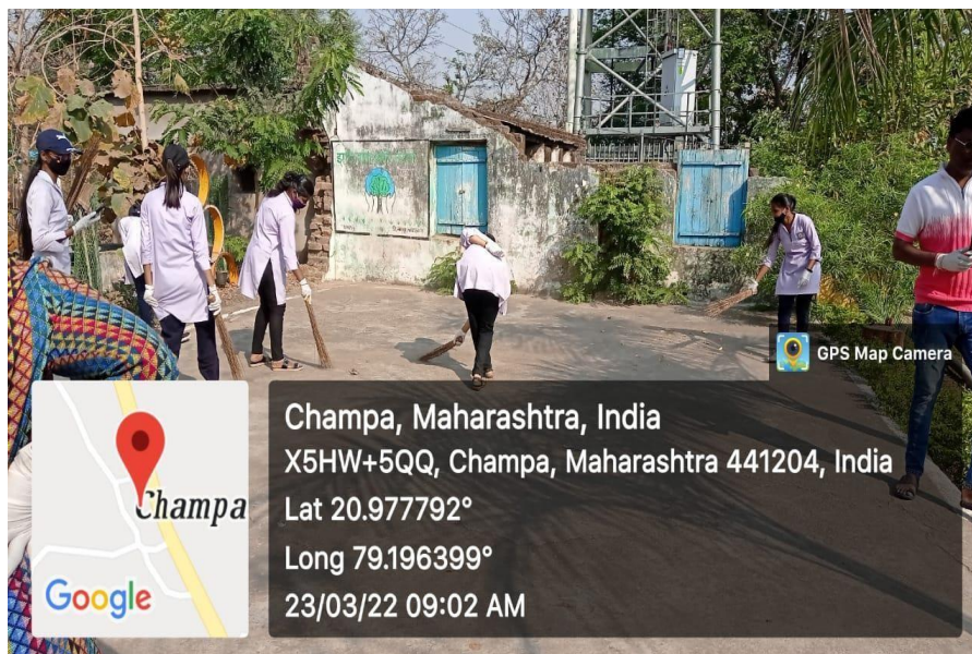
Cleanliness awareness 1

Under beyond the campus environmental promotion activities following activities were conducted Gram Swachhta Abhiyaan (Village Cleanliness Drive), Tree plantation on 23/03/2022, 27/03/2022 respectively. Two photographs of each event are given below.