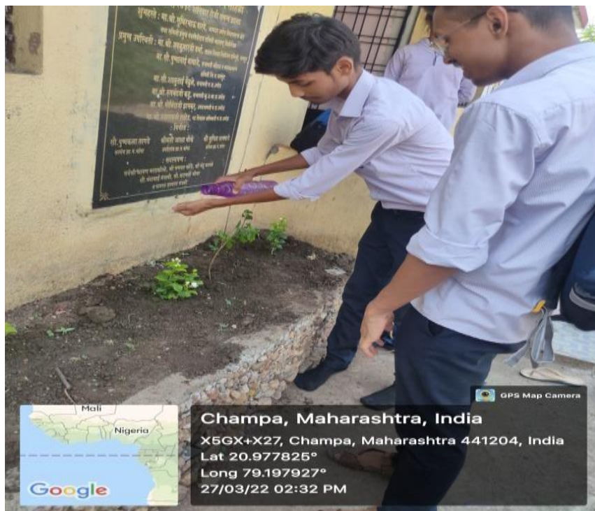
Tree plantation 1