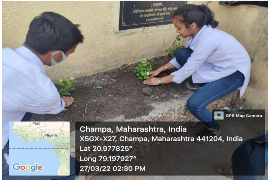
Tree plantation 2

Please go to the next page for the list of participants who participated in the NSS camp.