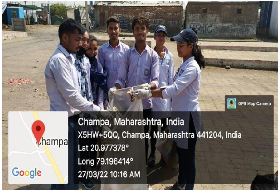
Cleanliness awareness 2