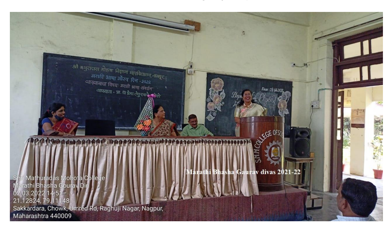
MARATHI BHASHA GAURAV DIN (MARATHI LANGUAGE CELEBRATION DAY)