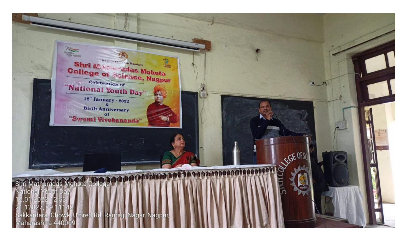
SWAMI VIVEKANAND JAYANTI – CELEBRATED AS NATIONAL YOUTH DAY: 2022