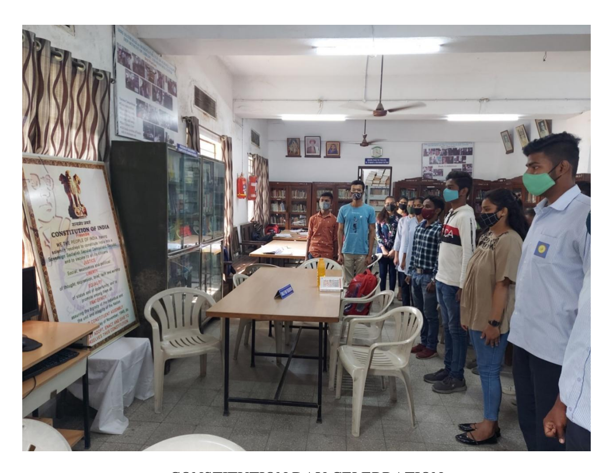
CONSTITUTION DAY CELEBRATION