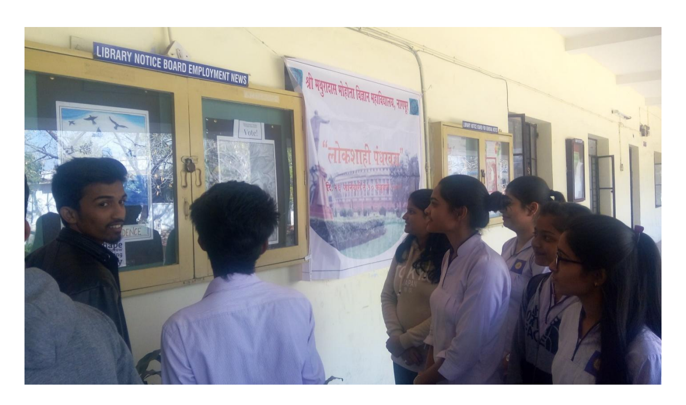
LOKSHAHI PANDHARAVADA (DEMOCRACY FORTNIGHT) - 2018-19