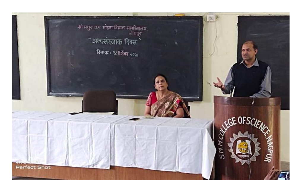
ALPASANKHYANK DIWAS (MINORITY DAY)