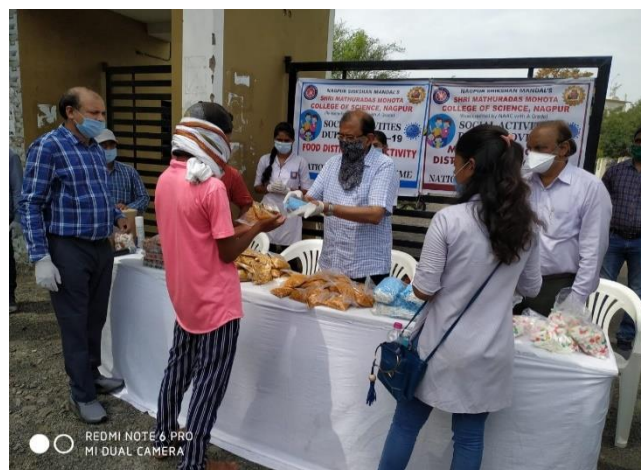
Management members, Principal and NSS volunteers during distribution