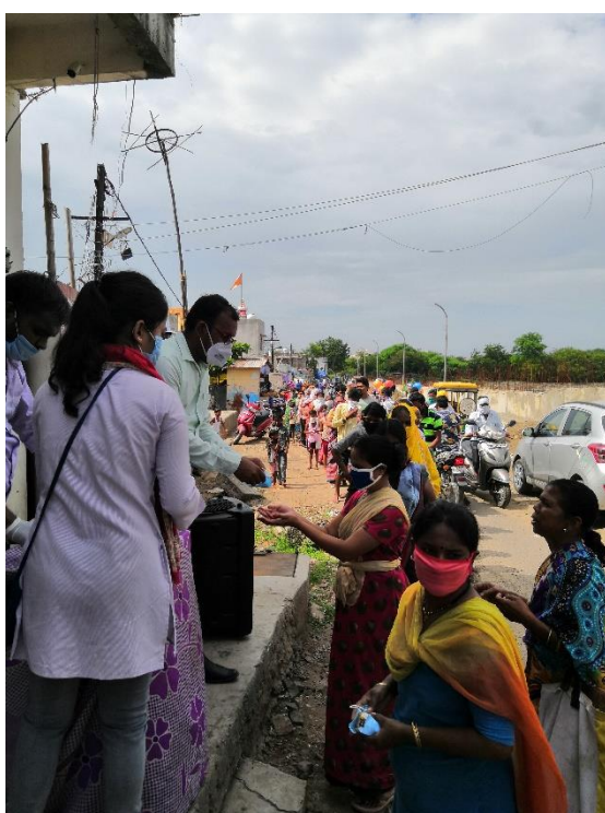
Mask and medicine distribution in slum area