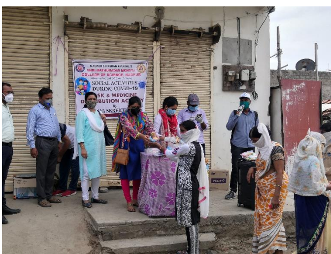
NSS volunteers and staff members distributing the material