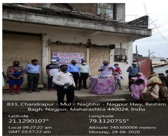
People from the slums during distribution drive